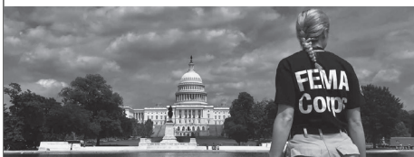
AmeriCorps NCCC 4