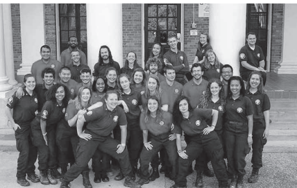
AmeriCorps NCCC 5